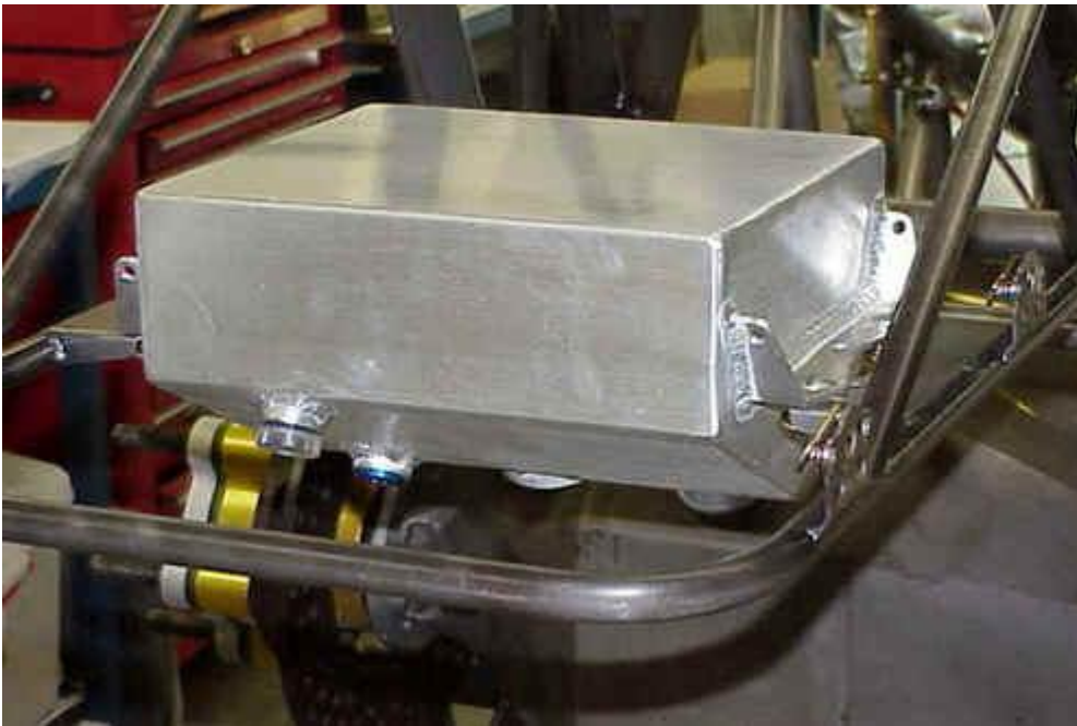
Puke tank on the back of an altered