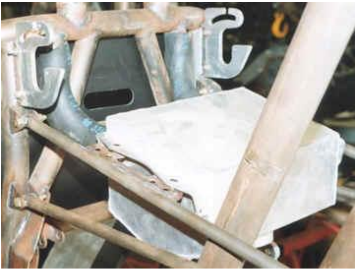
Puke tank on the back of an altered.