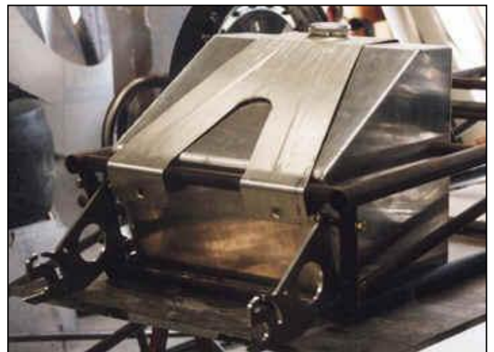
Fuel tank in an altered