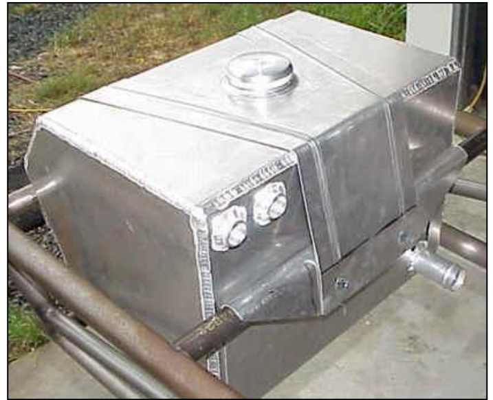
Fuel tank in an altered.